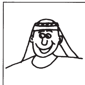
A kind and loving person