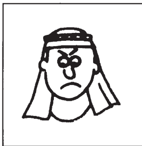
A selfish and unkind person